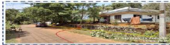
ROAD ACCESS TO THE PROPERTY

Ref No: 20051514/6/C/1690040679/Kurukayil Meehal Venu